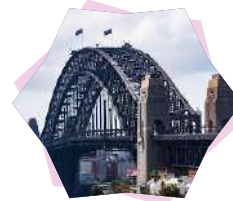
Bridge Climb Sydney