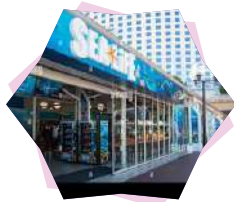
SEA LIFE Sydney Aquarium